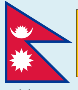
Only nonrectangular flag