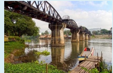
Name of a movie. This is the 'actual' one.